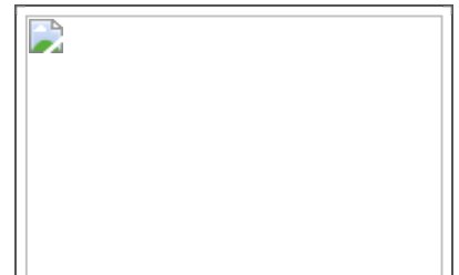
Accommodations of Desire, 1929

Study for “Soft Construction with Boiled Beans (Premonition of Civil War)”, 1934 Ink and pencil on paper Museo de Arte Contemporáneo Español Patio Herreriano, Valladolid, Spain