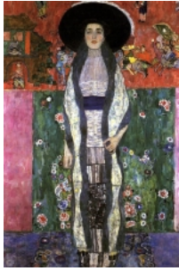
Portrait of Adele Bloch-Bauer II

Measures: 190 x 120 cm Technique: Oil on canvas Depository: Privately owned