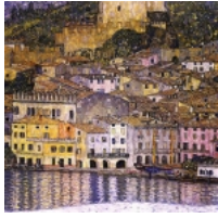
Malcesine on Lake Garda

Measures: 110 x 110 cm Technique: Oil on canvas Depository: Destroyed by a fire set by retreating German forces in 1945 at Schloss Immendorf, Austria.